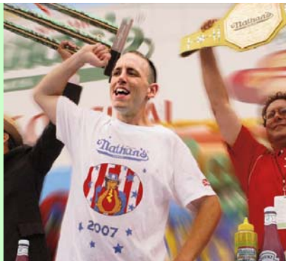
Nathan's Famous Hot Dog Eating Contest!